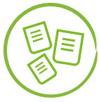
Figure One: Four themes and eight principles